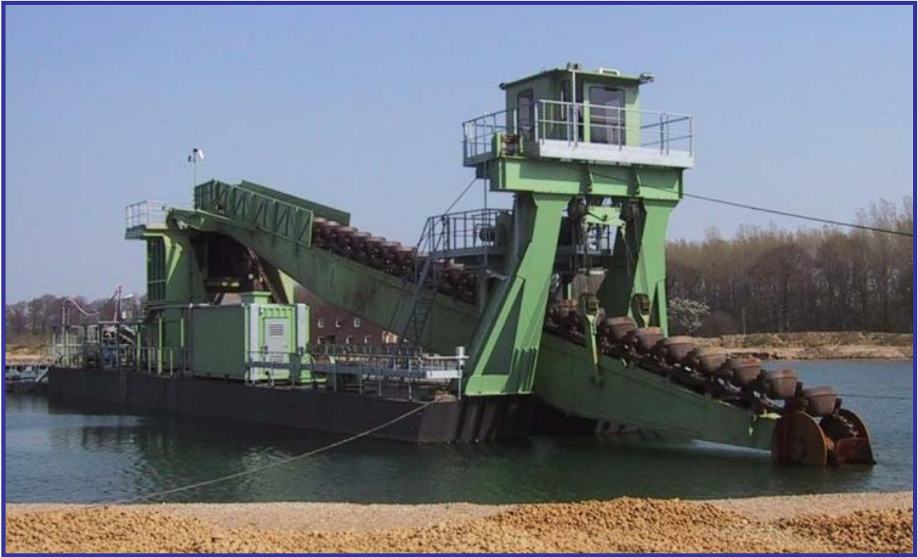
FLOATING BUCKETLADDER DREDGE