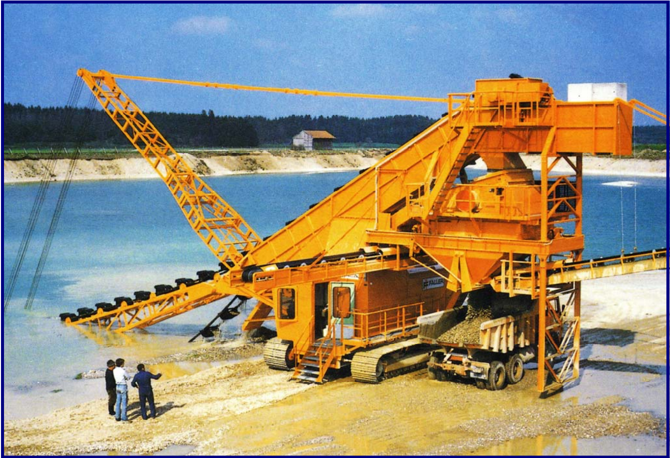
LAND BASED BUCKETLADDER DREDGE