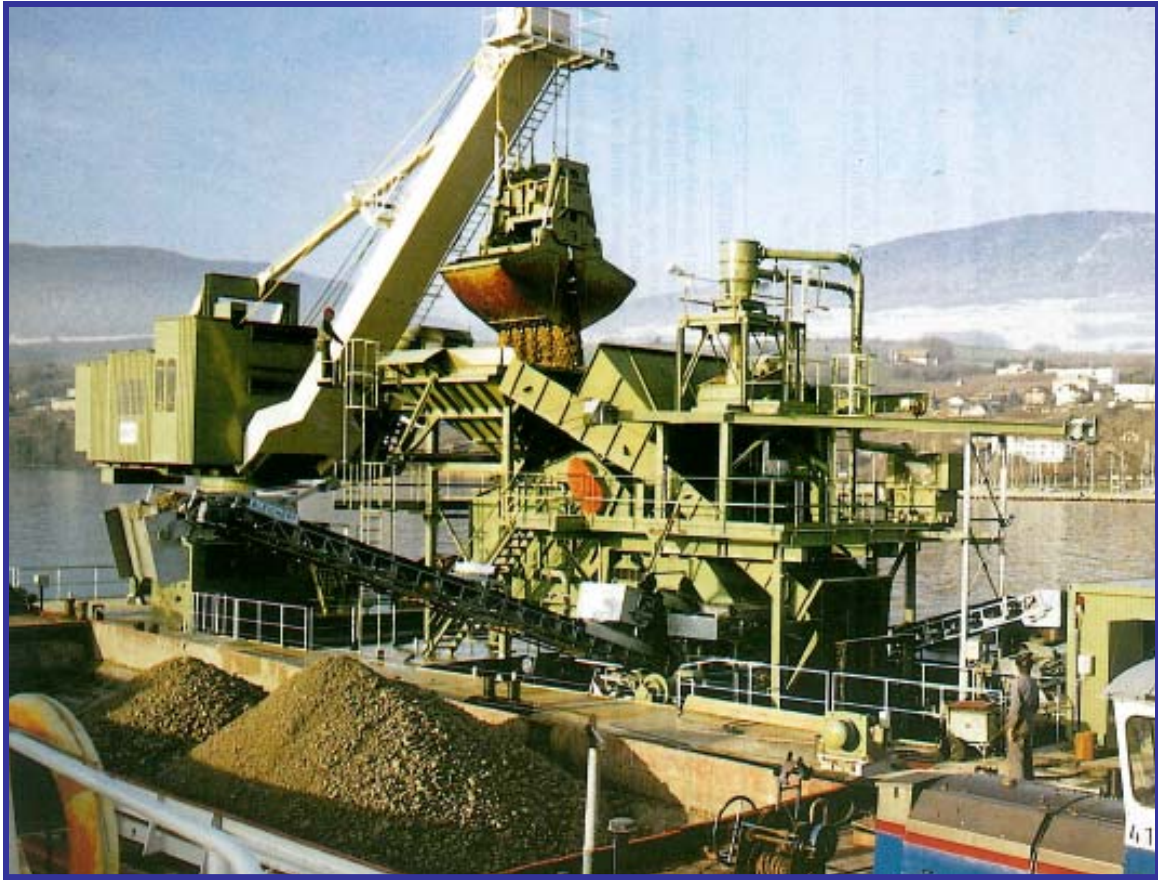
SLEWING CRANE CLAMSHELL DREDGE